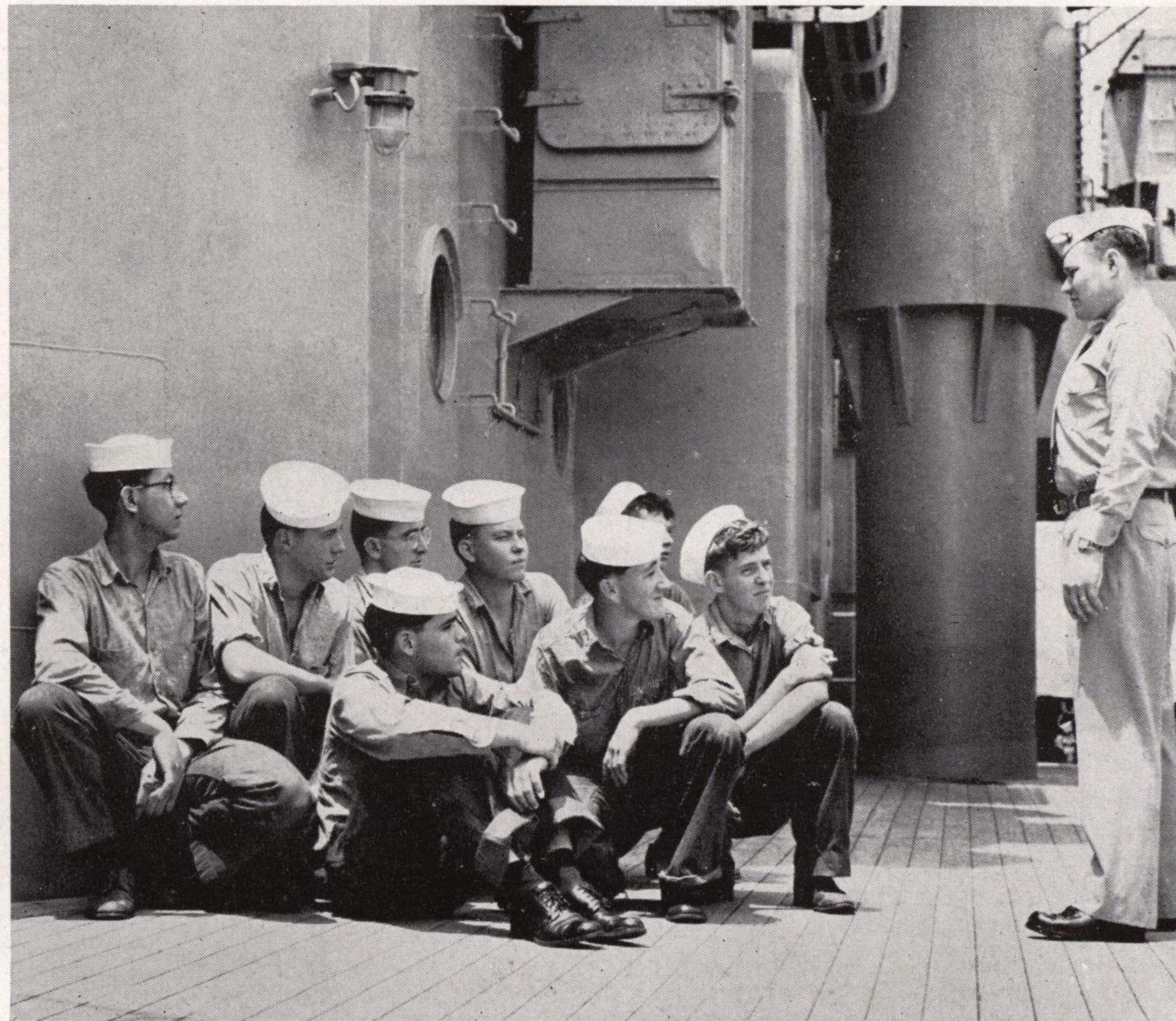
the Legal Officer, the Chaplain, the Training Officer, the Chief Master-at-Arms, and many others tell him about the ship.