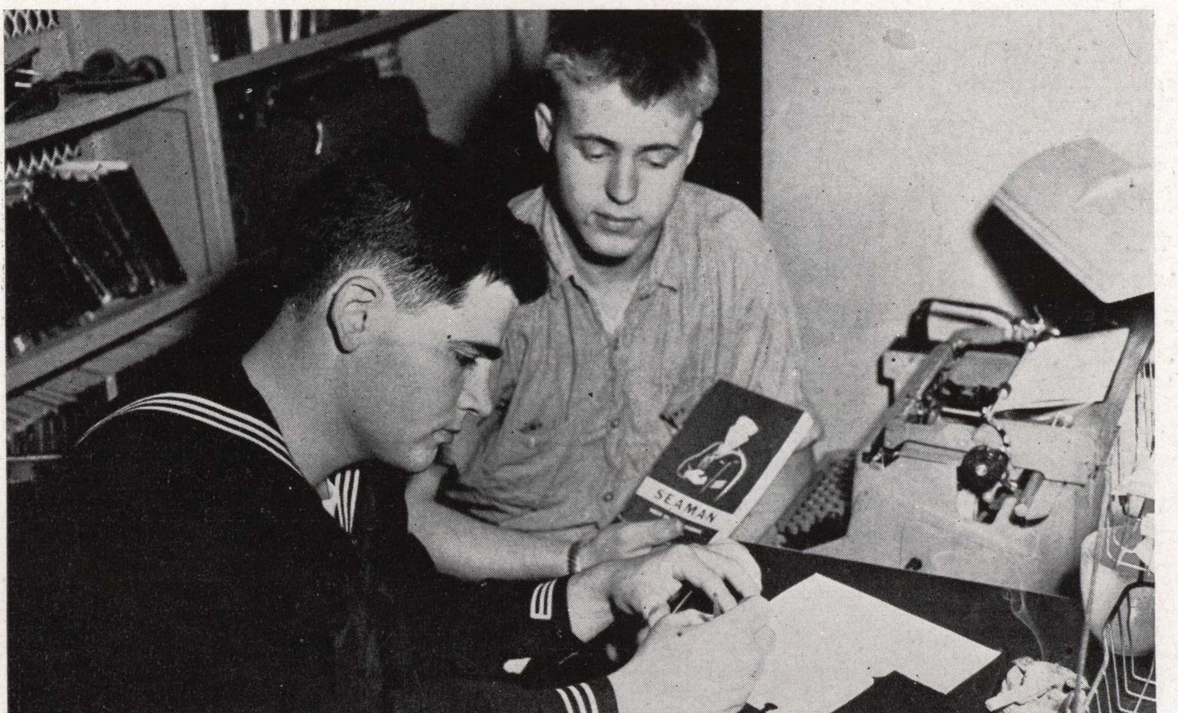
A NEW DIVISION OFFICER , and a new job. His new petty officers now begin the training that will make him a real part of the ROCHESTER's crew, doing one of the jobs that keep the ship moving. Shortly after his permanent assignment is made, he reports to the Training Office, where he gets a Seaman's Manual and signs up for his first Navy correspondence course. In the course of his Naval career, if he takes advantage of his opportunities, the boot can advance up the ladder to chief petty officer or officer level.