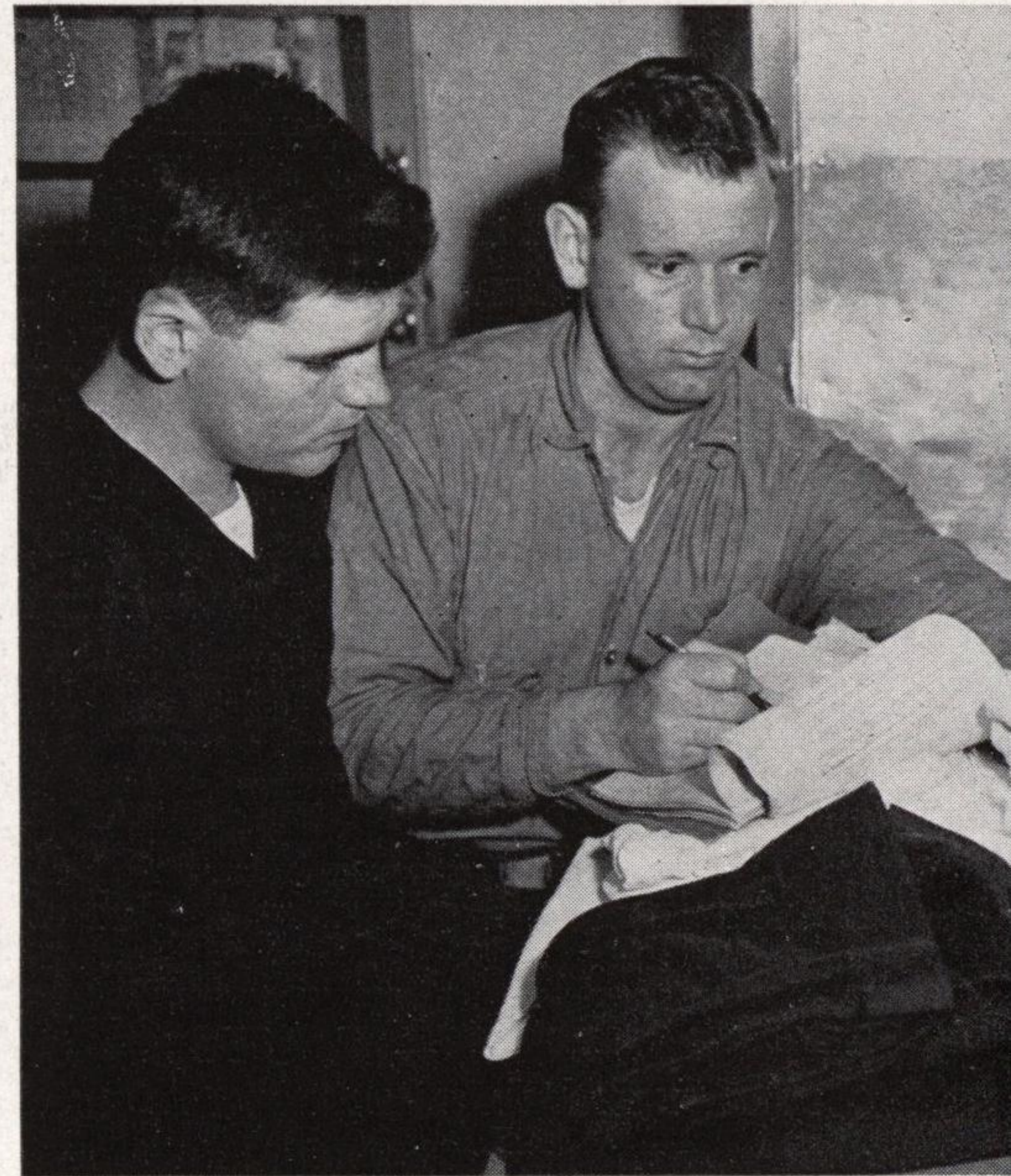
"WHAT, AGAIN?" His sea-bag is given a check for completeness.