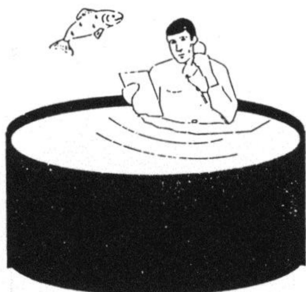
X.O.'S CELEBRITY HOTTUB