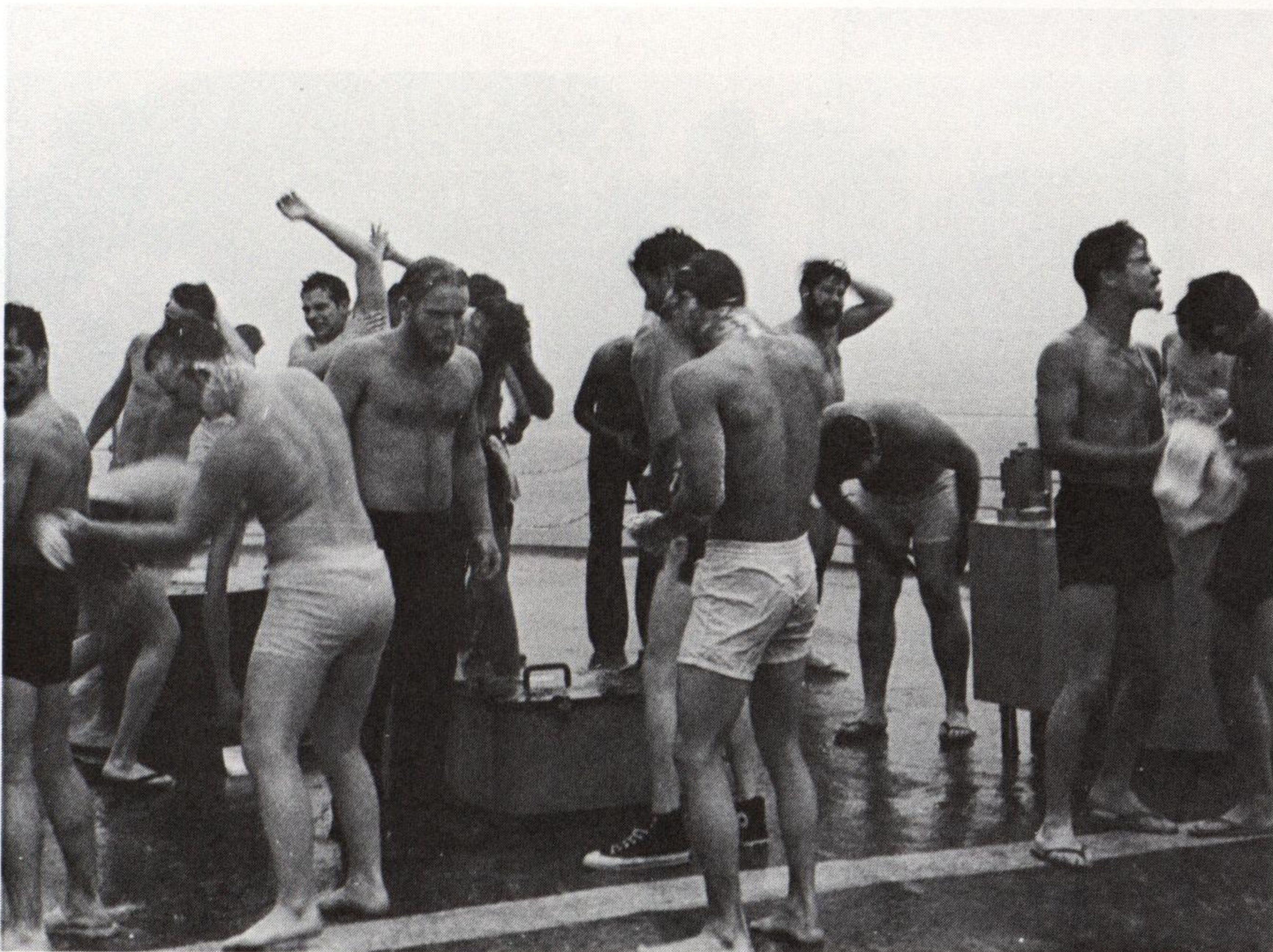
Feedwater being what it was (or wasn't, as the case may be), occasionally it was necessary to take advantage of sudden rainstorms to lather up.